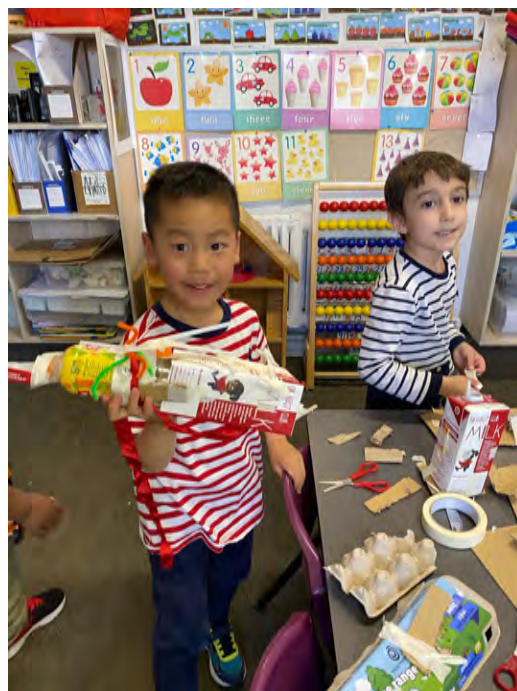
More Makerspace pictures. Left: B33 at Broadmeadows campus, Right: Lower Primary at Collingwood campus.