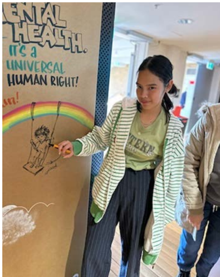
Remarkable art added to the World Mental Health display by our students!

Students from Craigieburn and Broadmeadows campuses went to the Hume World Mental Health Expo at Broadmeadows Town Hall. This event was organised by Hume City Council in conjunction with the Sebastian Foundation.