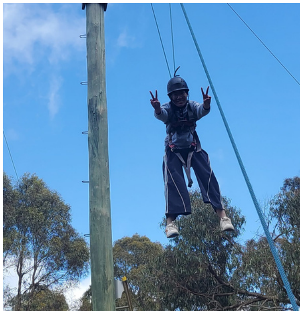
A very brave student taking a leap of faith.

From the 25th - 27th of October students from each campus went to Camp Doxa. The camp was loads of fun! Students not only got to participate in exciting activities like archery and rock climbing, but also had the opportunity to see some of Australia's interesting wildlife up close.