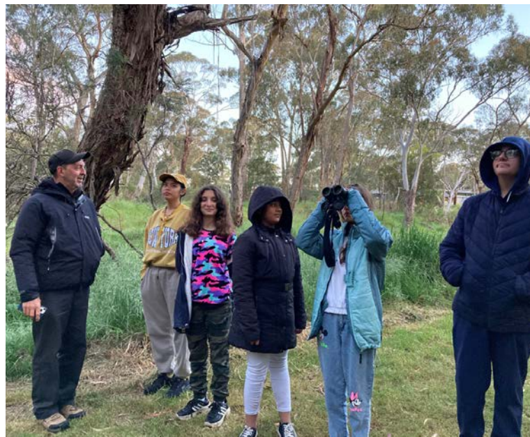
Students spying on some of camp Doxa's wildlife.