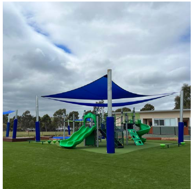
Some of our students relaxing beneath South Morang's new shade sails