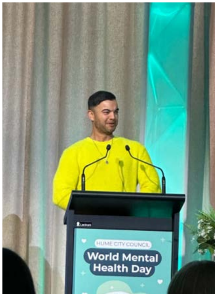
Guy Sebastian addressing the students.